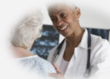
Health Services & Software